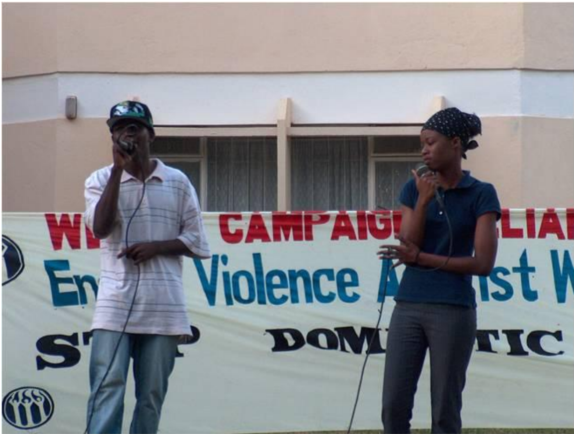
They decided to do a collabo, but the lady outsmarted Mentor Jay although the message was still passed.