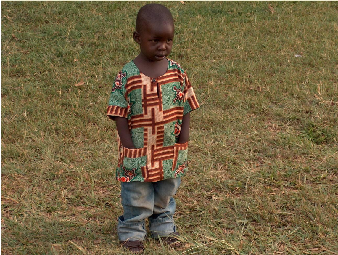
The young Man hadn't known why mama had come to the Event.