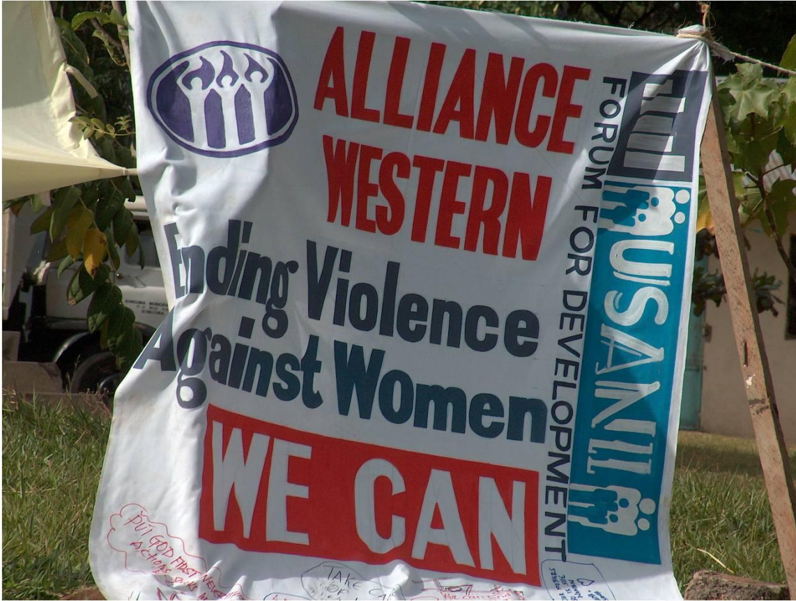
Avery Clear Message.