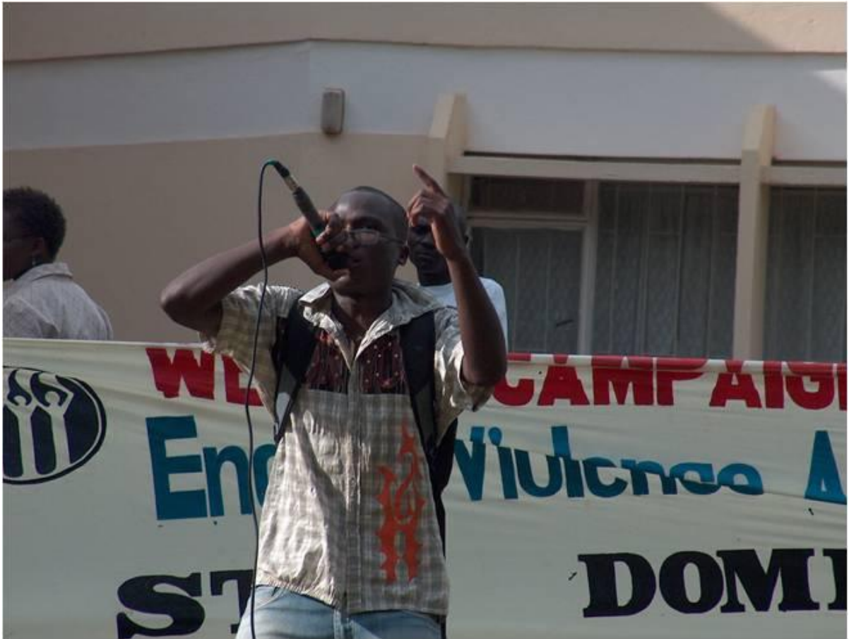
Local Artiste Passing the message to the masses.